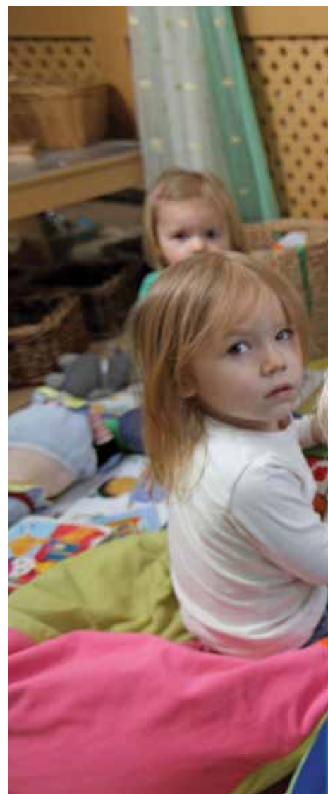
Narrative is a critical part of our social and emotional development

Decontextualised language is a form of language that is regularly employed in the learning environment of school and is important for children's academic development. It is described as language that is not