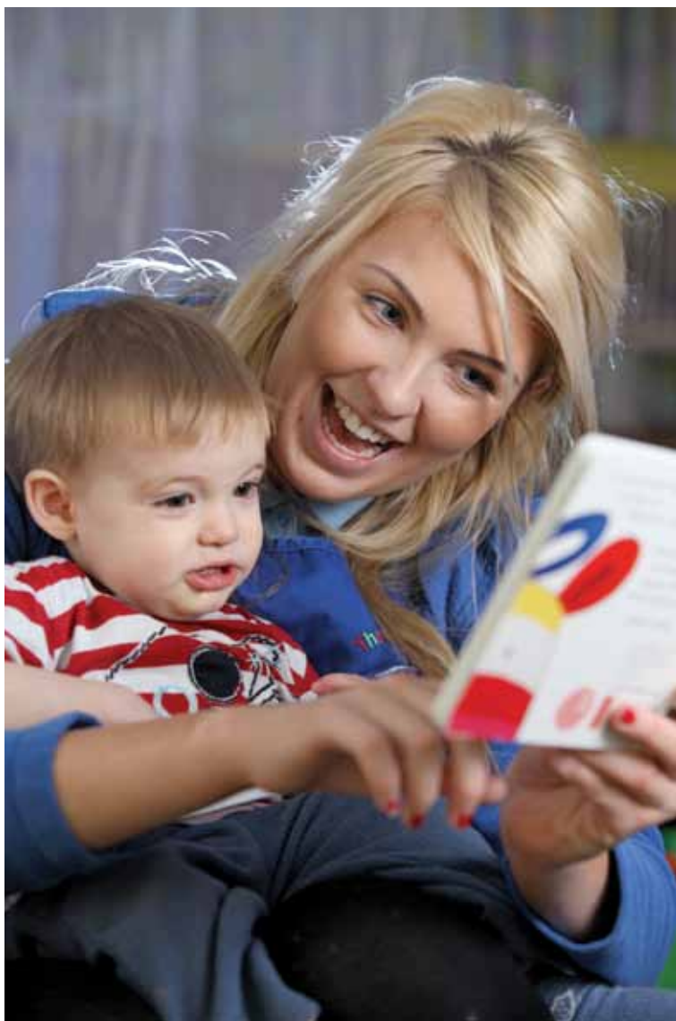
Home reading routines are the most important predictor of a child's oral skills